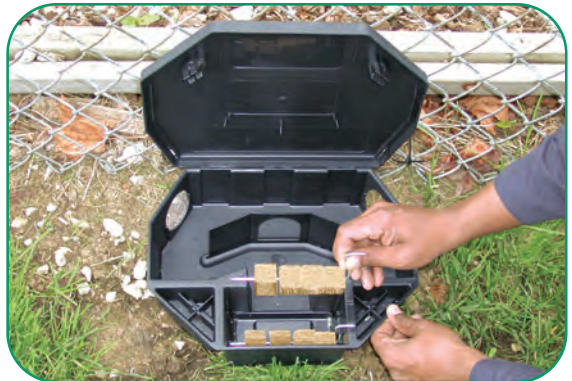
Generation blocks, placed in an Aegis ® bait station, can be easily secured for exterior baiting.