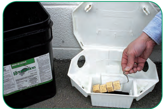
\frac{3}{4} oz. Generation blocks allow more placements per bait station. Great for controlling large rodent populations.